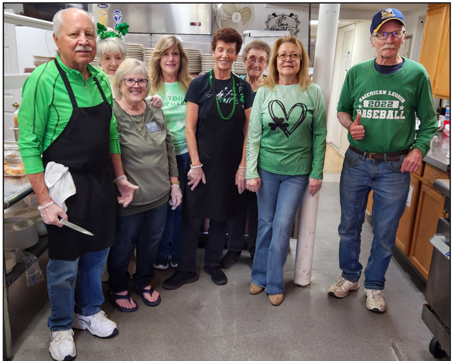
Thank you St. Patrick's Day volunteers.