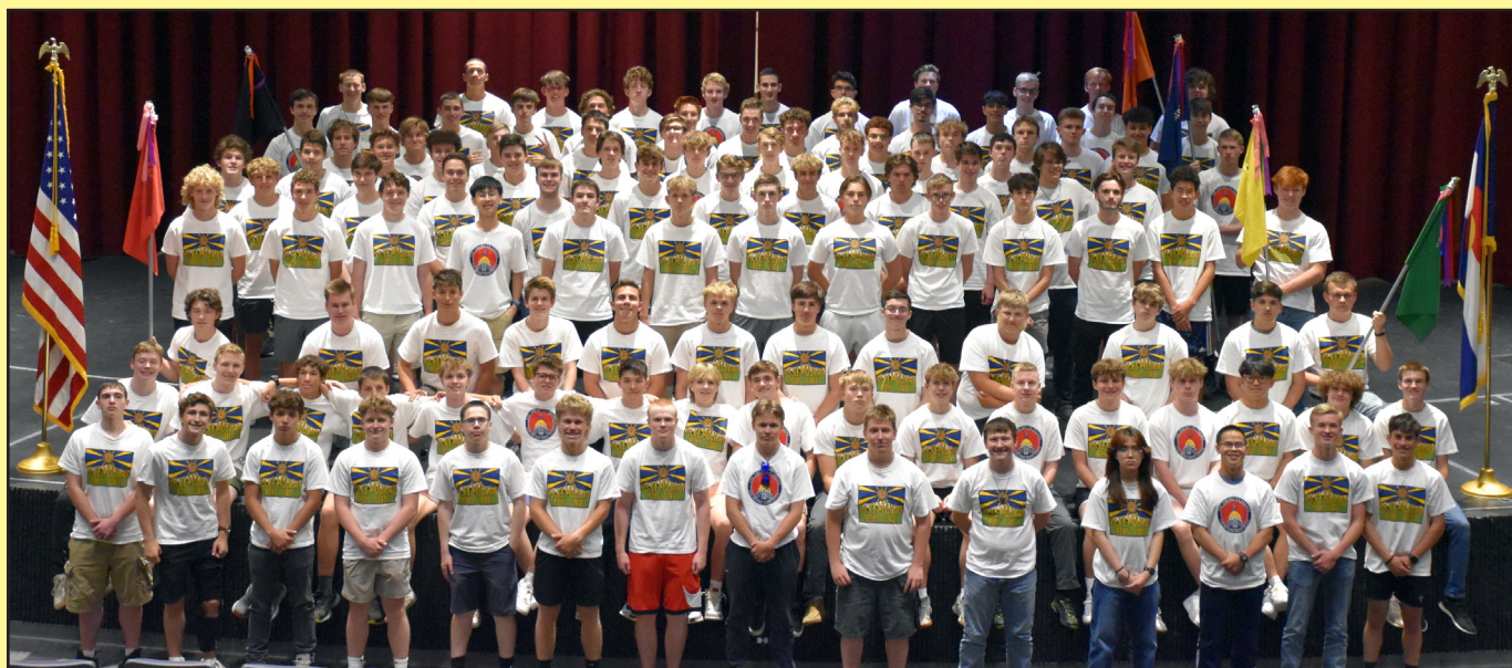
Colorado Boys State delegates come from every part of the State.