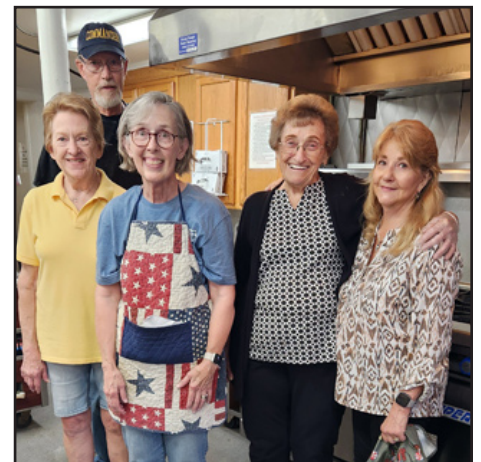
Thank you Father's Day volunteers.

Please attend our August meeting to see our awards and more highlights from Convention.