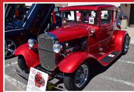
Gary Higns 1930 Ford Model A SAL Pick