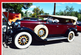
Vicki & Art Buschell 1930 Buick Lakewood Mfg. Pick