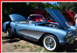
Larry LaPole 1957 Corvette Auxiliary Pick