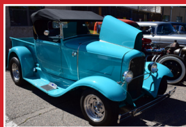
Jim Hungerford 1931 Model A Pickup Judges Choice