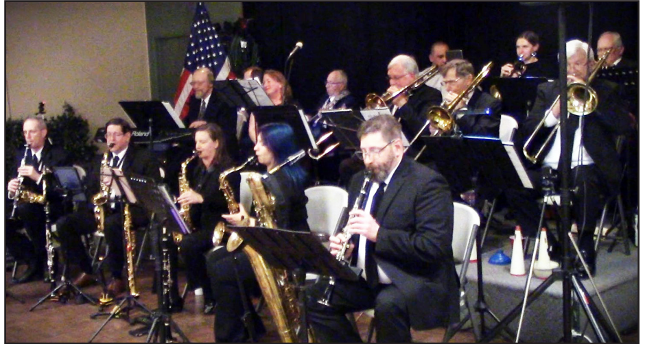
The All American Big Band will provide the 1940s swing music on Friday, April 21st while the Riders put on a $12 Prime Rib Dinner.

I want to say thank you again to all members for allowing me to be Commander of the best Post in the state. It is truly a pleasure to serve all of you! Ever Forward!