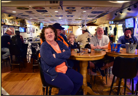
Above: Fans enjoyed the Super Bowl and a buffet of food at the Post.