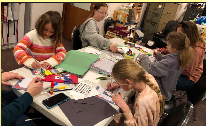
Junior Auxiliary members were busy making "thank you for your service" cards at the Post recently.