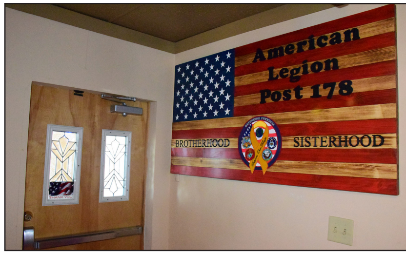
The beautiful wooden U.S. flag created by Tom Hall of Wood Crafts by Tom and donated to our Post. Thank you, Tom.

Wood Crafts by Tom (Tom Hall) donated a custom highly detailed wooden flag to the Post. This unique flag is on display in the South door entrance alcove. A big thanks to