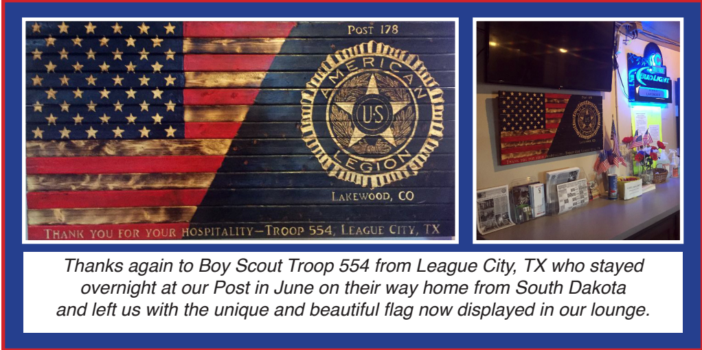
Thanks again to Boy Scout Troop 554 from League City, TX who stayed overnight at our Post in June on their way home from South Dakota and left us with the unique and beautiful flag now displayed in our lounge.

2022 dues are now payable for SAL. Either mail them in or drop them in the SAL strong box. Please make certain we have your correct e-mail address so you can get the newsletter and updates to other goings on.