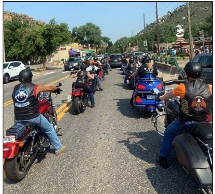
Riders make their way through Morrison, CO on their way back to Post 178 during the Victory For Veterans Ride in July. The event raised more than $2,000 for Vets.

Get ready to start baking for the Car Show Bake Sale which will be on September 18th.