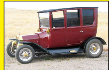
1915 Ford Model T Lynn Hunter