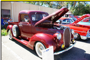
1939 Ford Pickup KC VanNeiman