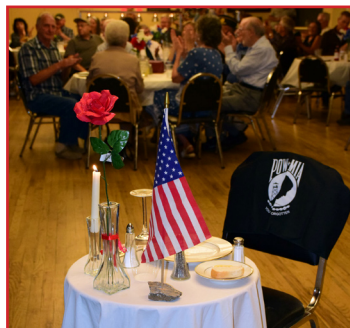
POW/MIA Table Never Forget