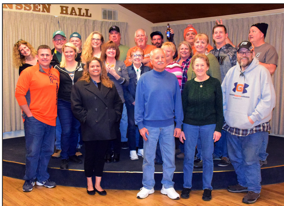
The Super Bowl gang ate, drank, and all but one or two of them celebrated the Eagle's victory over the Patriots.