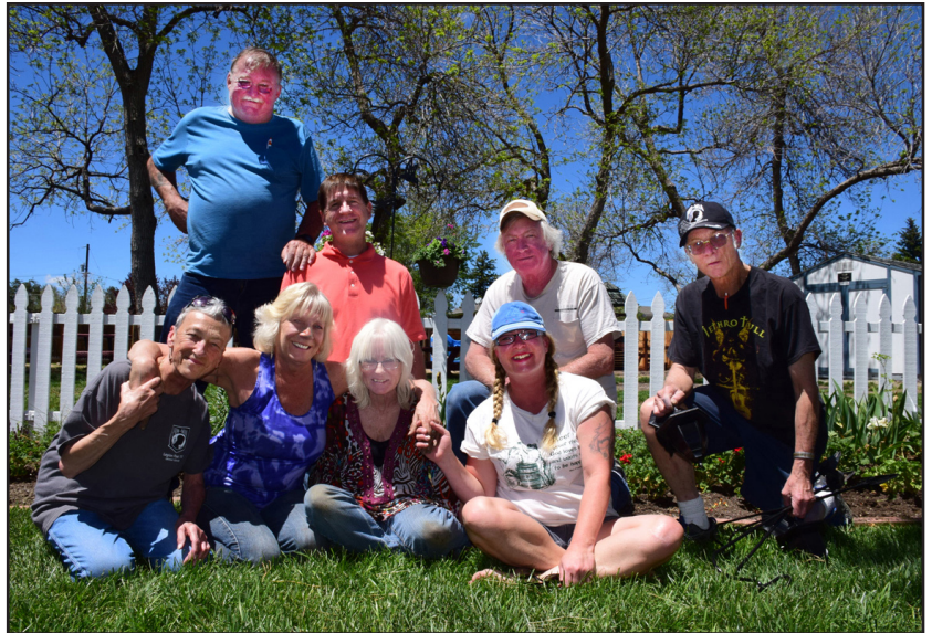
Thank you backyard garden and landscape volunteers.