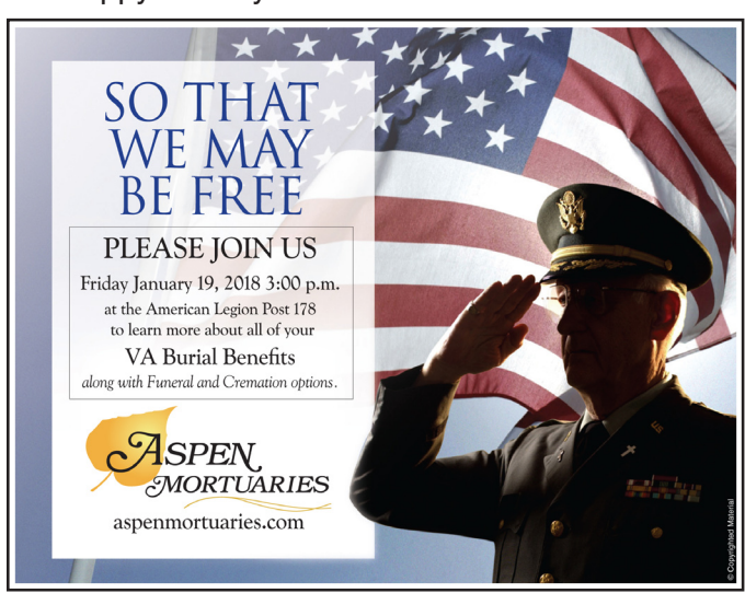
Post 178 will host a seminar January 19th at 3:00 p.m. conducted by Aspen Mortuaries. Subjects include VA Burial Benefits plus Funeral and Cremation options.